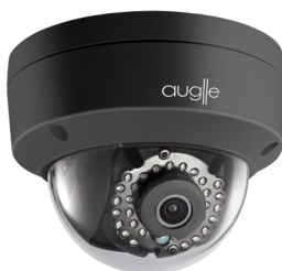
Hotspot IP LITE Camera