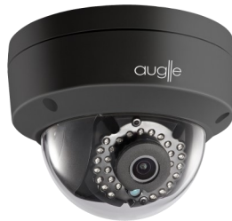
Hotspot IP LITE Camera